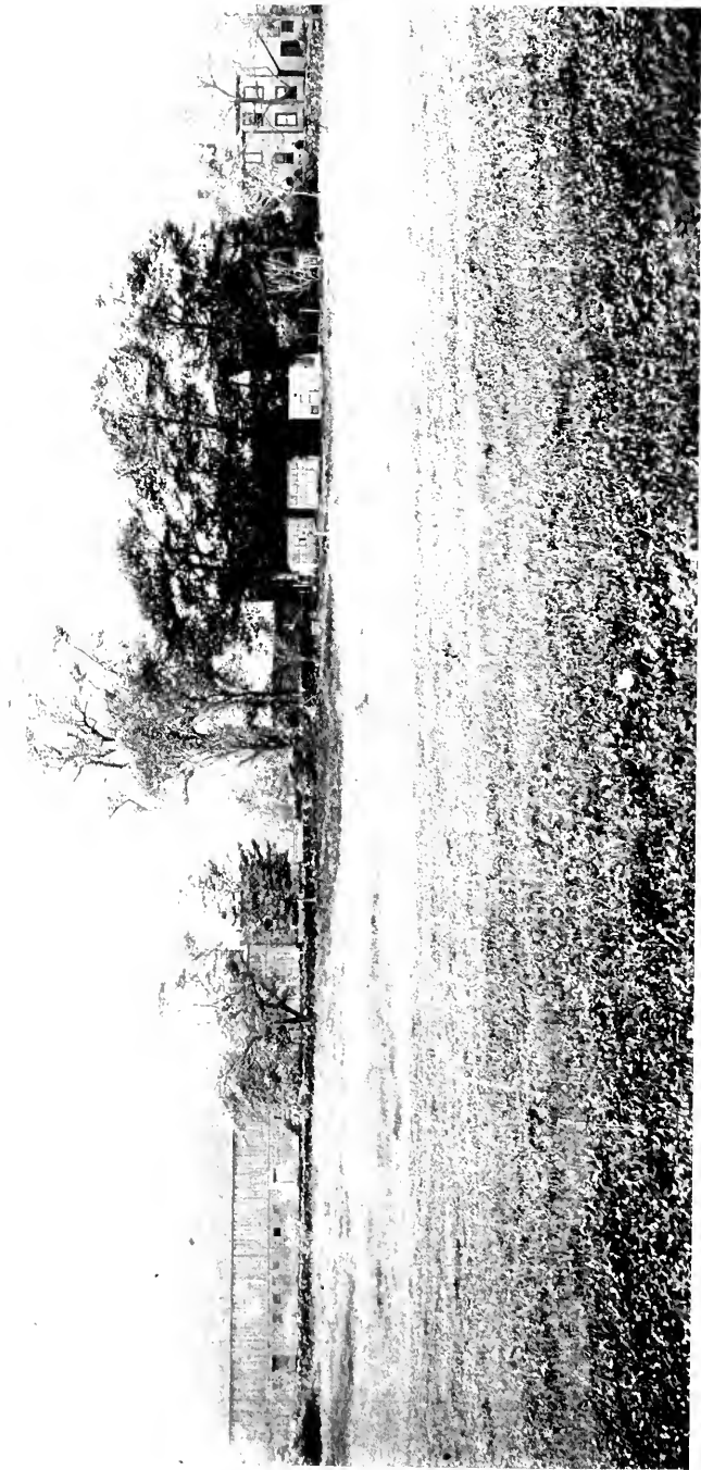
OLD BENT HOMESTEAD, MARLBORO, MASS.